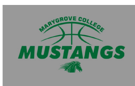
Screenprint design for item #'s 2, 3, 5, 6, & 8.