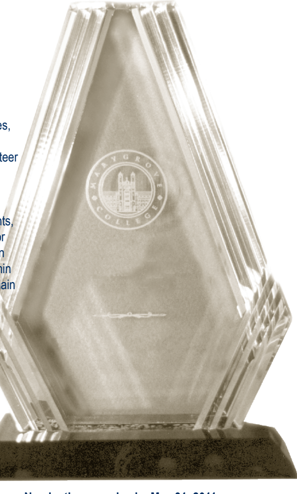
Nominations are due by May 31, 2011.

Please make your nomination using the form below and include the required documentation. You can also read about past award recipients at: www.marygrove.edu/alumni.